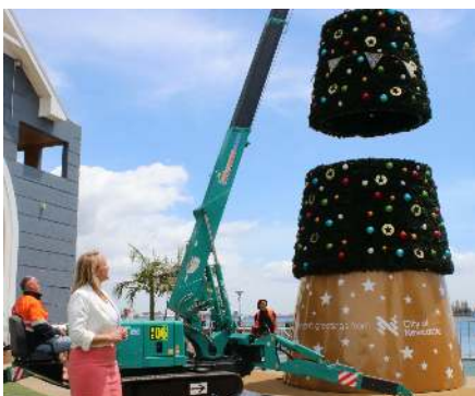
Lord Mayor Nuatali Nemes watches the giant Christmas tree going up in Newcastle Australia .

The Fenwick (department store) in Newcastle upon Tyne, UK is famous for its Christmas window display. Since 1971 there has been a Christmas display in the shop's windows, and people come from near and far to look at them. Last year it was “The Snowman”, and this year its “Charlie and the Chocolate Factory” - with detailed sets and sophisticated moving figures across its 6 windows that enchant children and grown-ups alike.