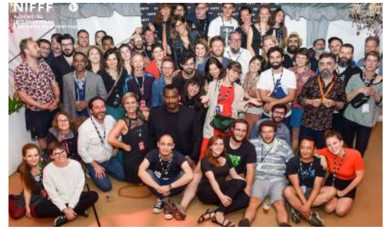
Above - the NIFFF organising team

The 2019 International Fantasy Film Festival Neuchâtel (NIFFF) attracted a record 48,000 festival-goers. It confirmed its position as a major event in the Swiss and international film landscape and is enjoying sustainable growth on the eve of its jubilee in 2020. The supernatural comedy EXTRA ORDINARY of the Irish Mike Ahern and Enda Loughman won the Narcissus HR Giger (CHF 10'000 endowed by the City of Neuchâtel). The international jury also recognized Miguel Llansó's creative hysteria JESUS SHOWS YOU THE WAY TO THE HIGHWAY with the Best Production Design Award.