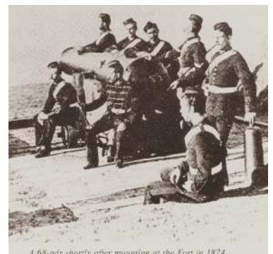
A 68-pdr shortly after mounting at the Fort in 1874.